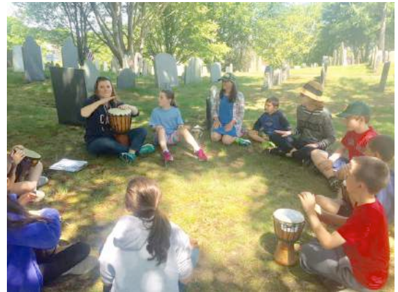
During the Memorial Day Service, a large group from Religious Education made the Annual Trip up Burial Hill to plant flowers on the graves of some of our Unitarian Universalist Ancestors, ending the day with a Drum Circle.