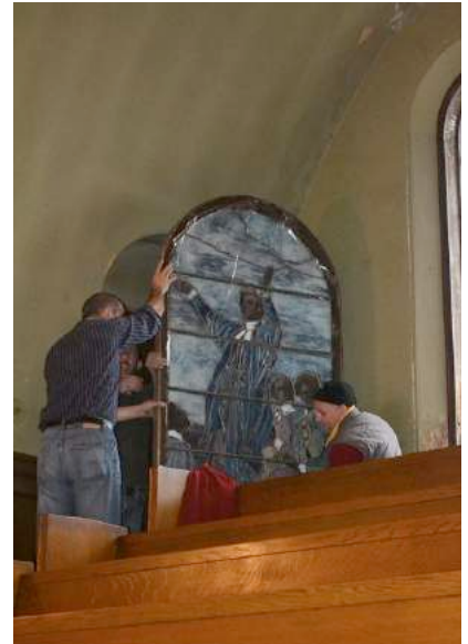
The Robinson Window being carefully removed.