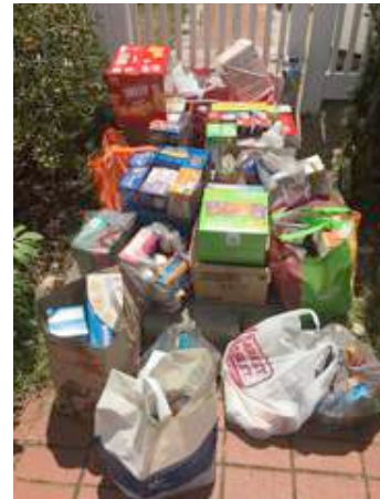
Just some of the food collected for this program

The RE Program and friends helped to plan and implement the Head Start Backpack Program for seven weeks this summer. We had many families participate by assisting with the food drive as well as counting, packing, and delivering 40 bags per week to Head Start. This program was a huge success thanks to all of the volunteers. It made a difference on so many levels.